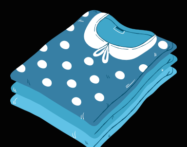
extra clothing including socks