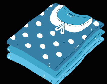
extra clothing including socks