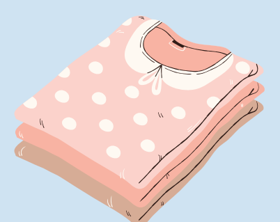
extra clothing including socks