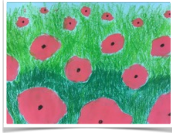
Poppy Art from Division 2