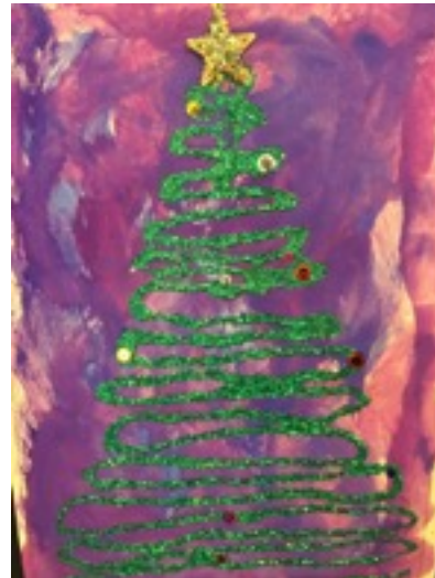
Seasonal art by Div 5